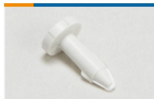
D-Sub Contact Accessories(1)