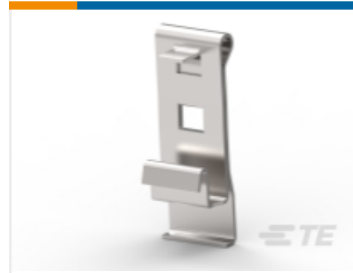
TE Part # 745255-2 SPRING LATCH 2/BAG