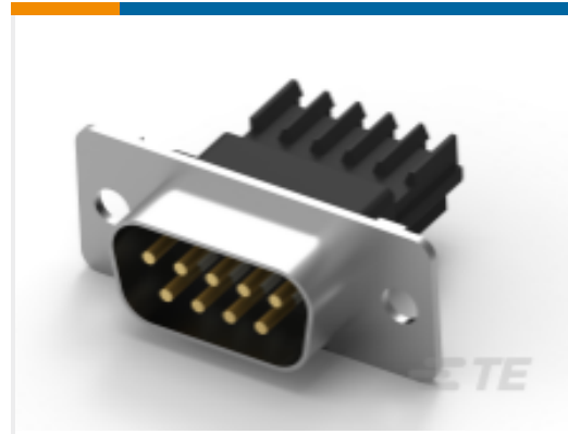
TE Part # CAT-AM7-248H3 IDC D-Sub: Plug Assembly, Wire to Wire, Signal, 2.77 mm