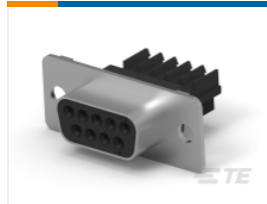
TE Part # CAT-AM7-248H8 IDC D-Sub: Receptacle Assembly, Wire to Wire, Signal, 2.74 mm