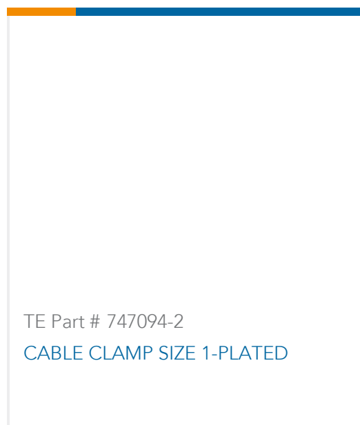
TE Part # 747094-2 CABLE CLAMP SIZE 1-PLATED